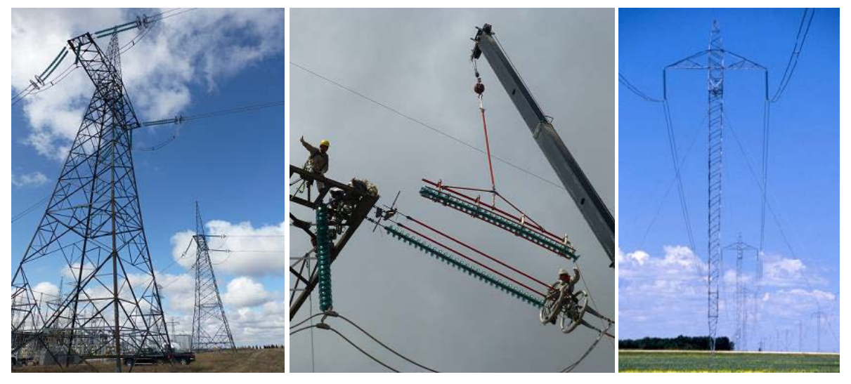
Fig 1- Deadend structure

The insulators to be tested have experienced various levels of stress dependent on placement on the lines. In the southern portion near Winnipeg, Manitoba, Canada, the terrain is open and flat with cultivated fields and little protection from wind. Near the center of the line and to its northern end the terrain transitions to boreal forest. Over 40 plus years in service, the Bipole insulators have faced high levels of vibration due to the nature of the twin bundled conductor and failed spacer dampers. The insulators have also contended with icing and ambient temperatures of -45 to 40 °C. Contamination levels range over the course of the line from very light to light. Because of the diversity of conditions existing over the 895 km length of the bipoles, the insulators were chosen near both ends of the bipoles near Winnipeg and Gillam, Manitoba, and the approximate center of the lines at Grand Rapids, Manitoba. Insulators strings were removed from the energized lines by Manitoba Hydro's Live Line Maintenance group, one deadend string of 29, 220 kN standard profile insulators (model N18P/171DC). Insulators were removed during May 5-11, 2014