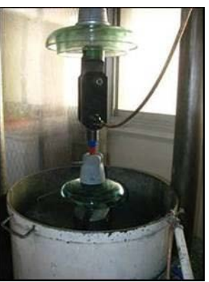
Fig11 - Insulator in traction machine