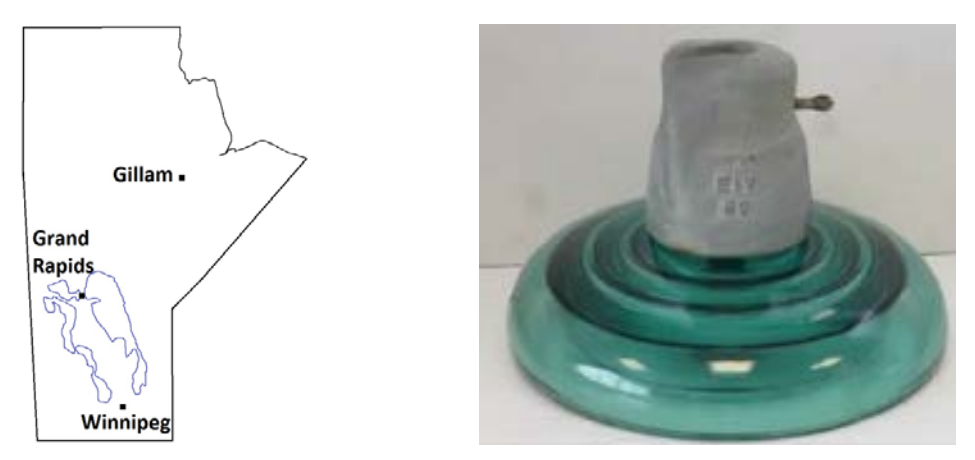
Fig 4 – Removal locations, Manitoba, Canada Fig 5 – Model N21/171DC (1969 production)