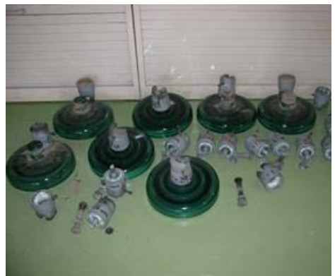
Fig 12 - Failed insulators