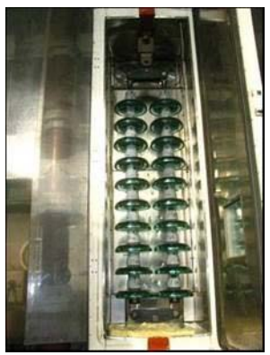
Fig 10 – Thermal mechanical machine