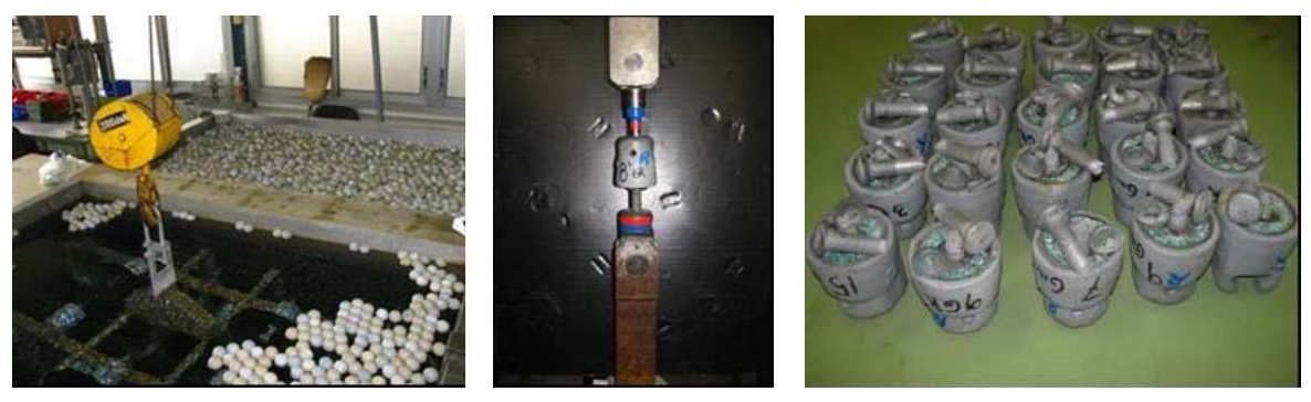
Fig 7-Temperature cycle test

The test results are fully satisfactory, with an acceptance constant higher than 0.65. In fact, all failing loads were higher than the M&E rating of an unbroken (intact) insulator. Similarly to the electromechanical failing load test, the N21/171DC samples all failed by a broken pin, which results in a lower standard deviation.